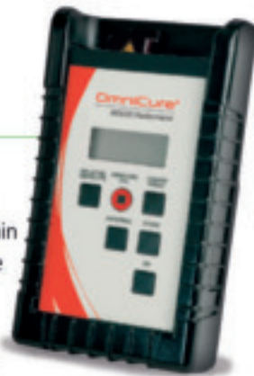
Optional Accessory: OmniCure R2000 Radiometer

Radiometry is an essential link for measuring the light output from a UV curing system in order to maintain a repeatable process. The OmniCure R2000 UV Radiometer can be combined with the OmniCure S1500 UV curing system to provide a complete curing station with unmatched control and repeatability.