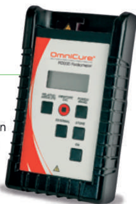
Optional Accessory: OmniCure R2000 Radiometer

Radiometry is an essential link for measuring the light output from a UV curing system in order to maintain a repeatable process. The OmniCure R2000 UV Radiometer can be combined with the OmniCure S2000 UV curing system to provide a complete curing station with unmatched control and repeatability.