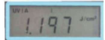
The "SELECT" button allows you to toggle between Watts and Joules.