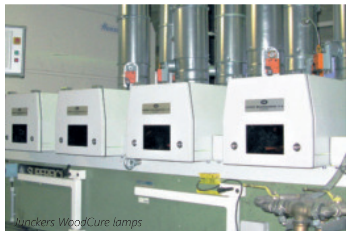
Junckers WoodCure lamps